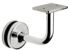
ST - 315