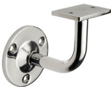
ST - 316