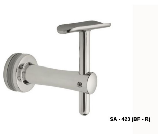
SA - 423 (BF - R)