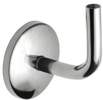
ST - 352