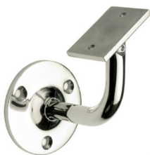
SA - 411