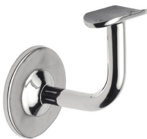
ST - 340