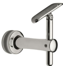
SA - 423 (BG - R)